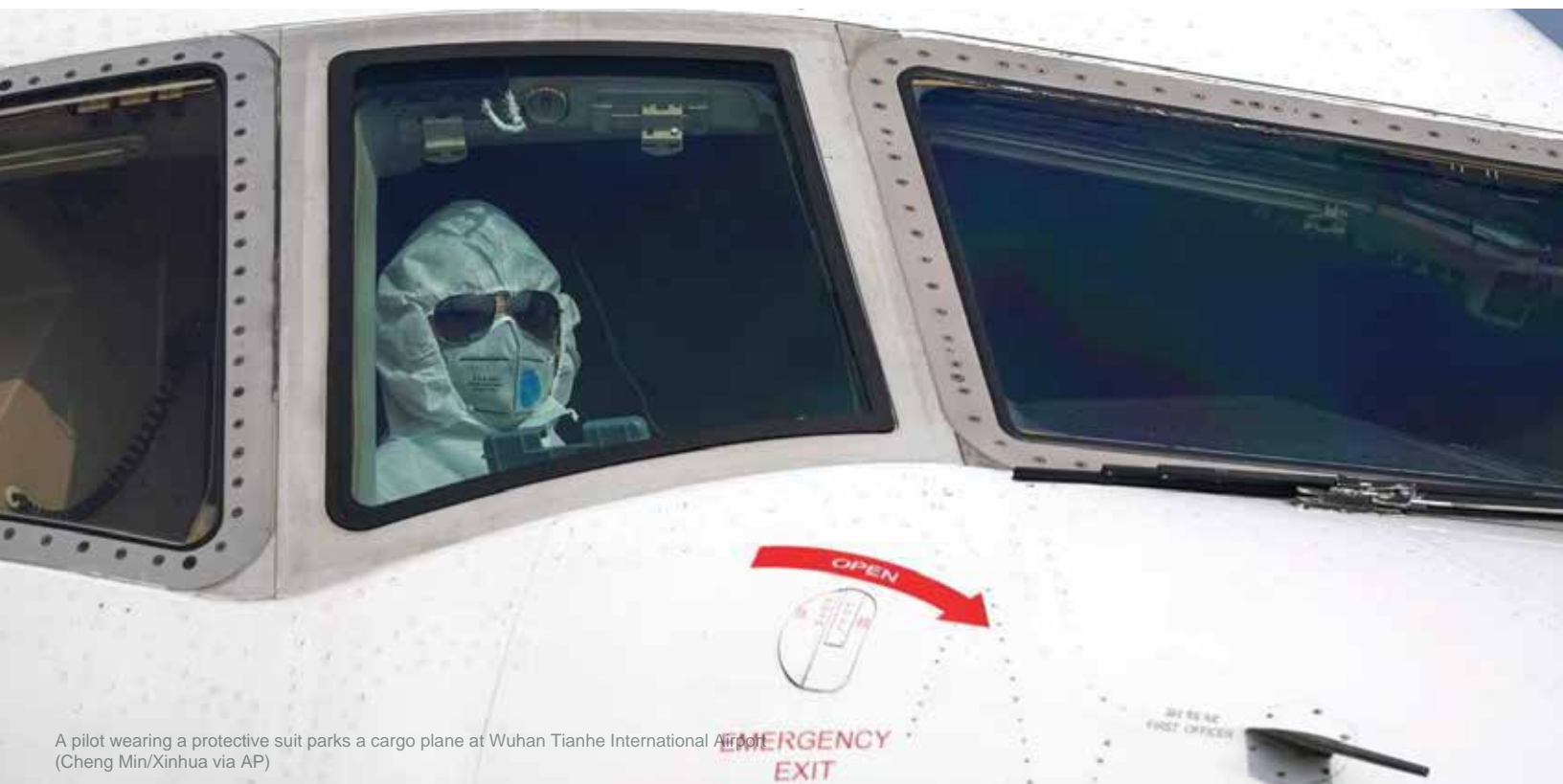
A pilot wearing a protective suit parks a cargo plane at Wuhan Tianhe International Airport

Register Now! Call: 703.466.0011 Email: info@cov-s.net